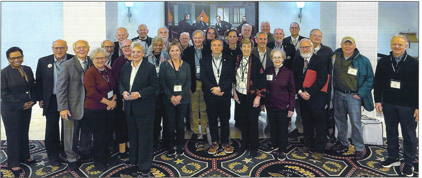
The Lincoln Group of the District of Columbia members at the 2025 Lincoln Forum Symposium